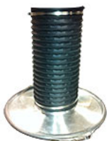
10" Drum Cover Kit(s)