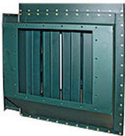
Staggered Channel Inlet Baffle